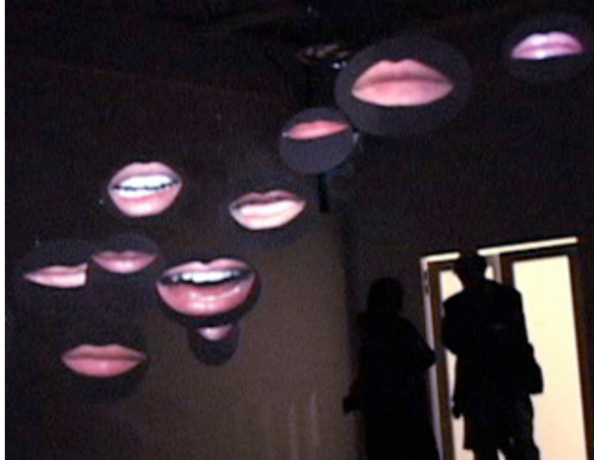
Figure 3 One River (running...) installation space at the Surrey Art Gallery on October/December 2005

Each sound, voice, character, moving image and other animated objects represents a strand in the braid. The media diffusion system provides the ability to place these media events in space and time. The diffusion system allows independent control of projections on screens and walls. This independence enables the experience of immersion and intensifies the image of a multiplicity of media objects. In this work we explored a new idea of pulling the two-dimensional screen apart and redistributing it in the space of the installation, thus deepening the sense of immersion and increasing the theatricality of the experience.