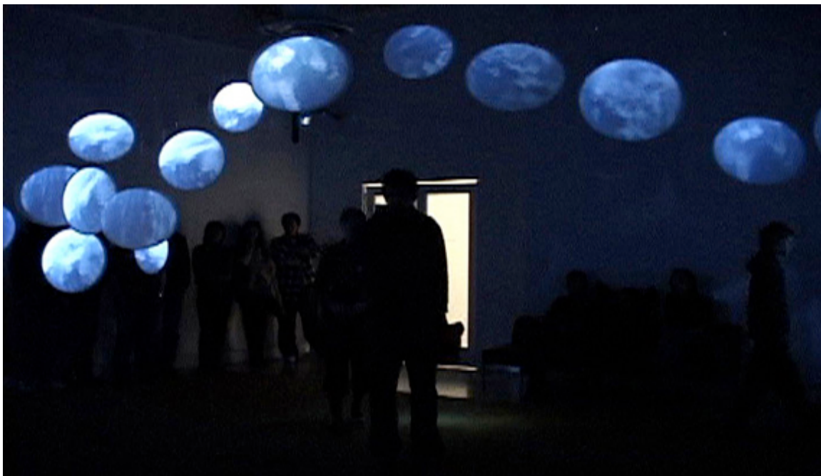
Figure 1 One River (running...) installation space at the Surrey Art Gallery on October/December 2005

One River (running...) is an immersive documentary installation— developed by the Computational Poetics Research Group—designed to celebrate the connections among Surrey citizens and to explore Surrey as a meeting place for diverse cultural groups. The connection among participants, with their different cultural perspectives, was grounded in common appreciations of Surrey as living space and meeting point. This work represents an idealized image of the Surrey community in a way that allows new conversations, dialogues and insights to emerge, through the braided process of symbolic juxtapositions. These braided conversations contribute to the construction of an idealized image of the community by provoking intersections of different social groups that in everyday life might not have the opportunity to come together.