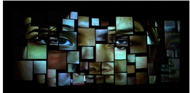
Figure 1. in a thousand drops... refracted glances installation

in a thousand drops... refracted glances is an audiovisual environment that constructs and deconstructs bodies through processes of stitching, repetition, collage, stretching, contraction, multiplication and reduction. As a result of these processes new hybrid fugal bodies are born that speak to the variety and complexity of the ecological and interpersonal balances that depend on the mutual interdependencies of the community of agents that make up its population.